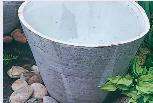
Above : Birch Pools. Below: Detail. Tall Birch Pool (BP51: ht 50cm, Sand) Medium Birch Pool (BP52: ht 35cm, Sand) Low Birch Pool (BP53: ht 21cm, Sand)