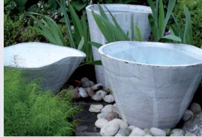
Left: Shallow Frog Pool (SFP54: dia 47cm, Marble Green)