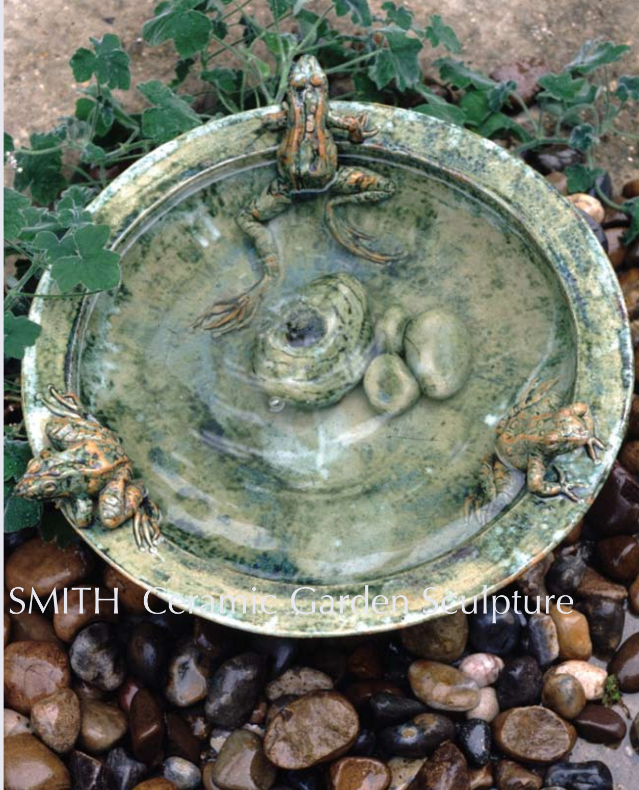
SMITH Ceramic Garden Sculpture