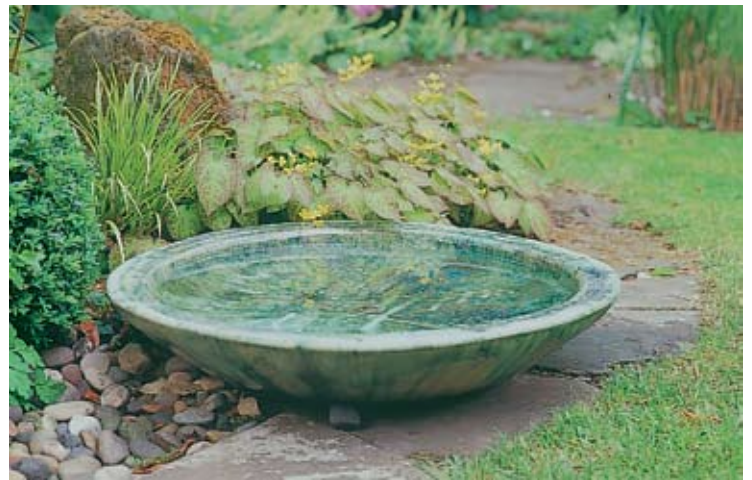
Below: Plain Bowl (CB46: dia 70cm, Marble Green)