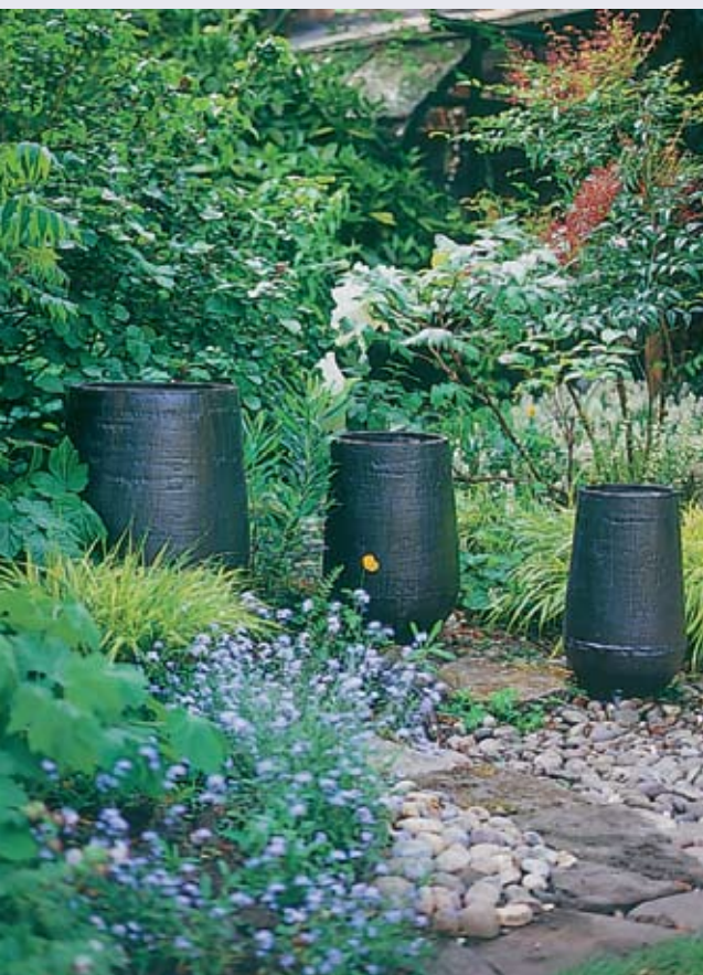
Above: Otter Pots

Large Otter Pot (OP48: ht 69cm, Graphite)