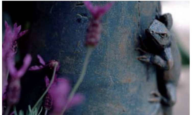
Left: Circular Lizard Bowl and Lizard Plinth (Bowl CB18: dia 70cm, Bark. Plinth CBP18: height 73cm, Bark)