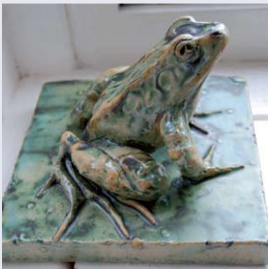
Below: Large Frog Fountain (FSLF45: 42cm x 42cm 29cm, Marble Green)