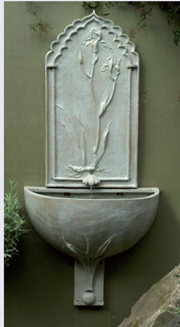
Top Left: Lizard Fountainhead, (SF4 : 35cm x 35cm, Stone) Lizard Bowl (FB11: 48cm x 23cm x 24cm, Stone) Lizard Bracket (20cm x 9cm, Stone) Bottom Left: Large Frog Wall Spout (FWM16: 30cm x 30cm, Marble Green) Above: Fish Fountainhead (RTF1: 49cm x 36cm, Marble Green) Bowl (FB8: 50cm x 25cm x 28cm, Marble Green) Fish Bracket (20cm x 9cm, Marble Green) Right: Iris Fountainhead (PF32: 85cm x 45cm, Acropolis) Iris Bowl (FB43: 34cm x 66cm x 32 cm, Acropolis) Iris Bracket (26cm x 15cm, Acropolis)