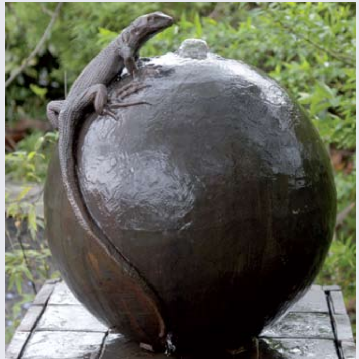
Left: Lizard Ball Fountain and Box Plinth Lizard Ball Fountain (LBF42: 61cm x 42cm, Bark) Box Plinth (BB44: 151cm x 54cm x 54cm, Bark) Above: Detail (LBF42, Bark)