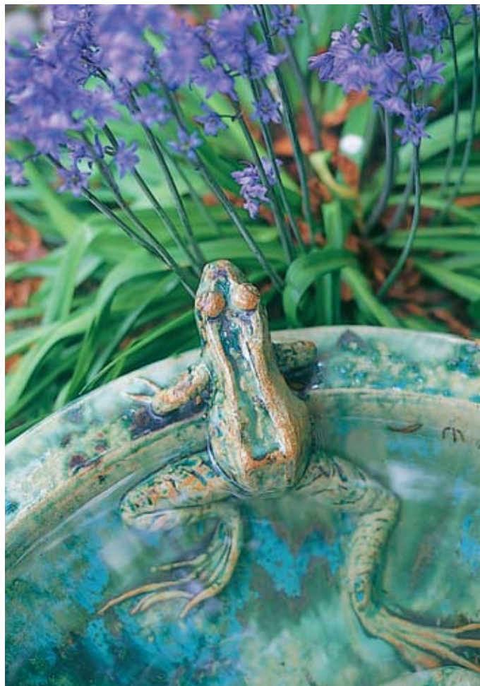
Left: Circular Frog Bowl (CB19: dia 70cm, Marble Green)