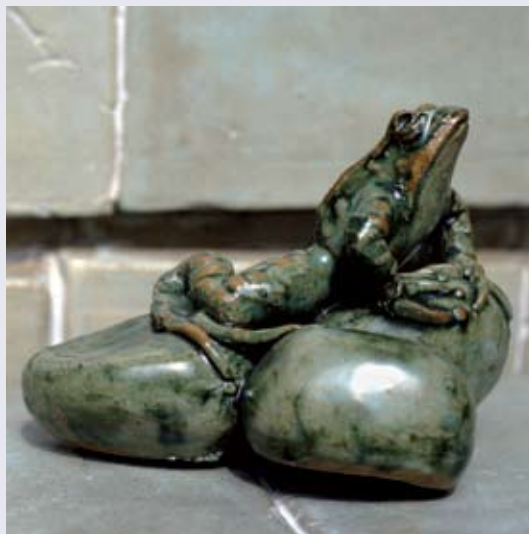
Far Left: Frog Fountain (FSF15: 34cm x 19cm, Marble Green)