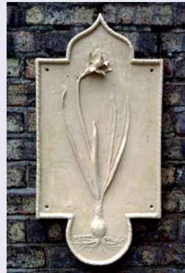
Left: Plantain (WP36: 74cm x 37cm, Sand) Above: Rabbit (WP26: 50cm x 31cm, Savannah) Right: Daffodil (WP35: 74cm x 37cm, Travertine) Below: Jumping Frog (WP25: 50cm x 31cm, Opaline)